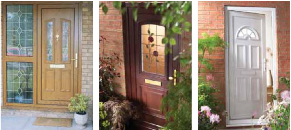
Light oak Rosewood White