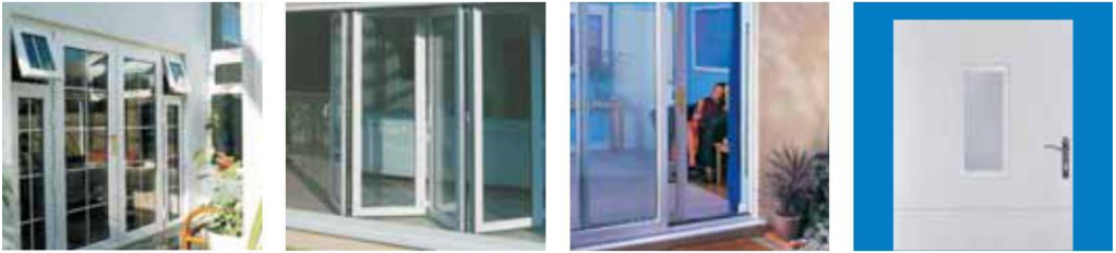
French Bi-folding Sliding Stable

Whichever type of door you choose, there is a wide variety of options when it comes to colour and finish.