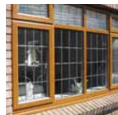
Top and side opening