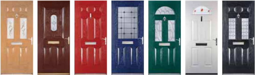
Oak Rosewood Red Blue Green White Black