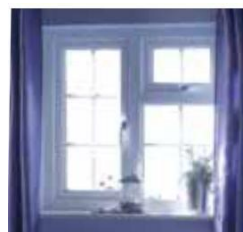
Top and side opening