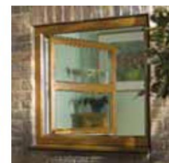
Tilt and turn